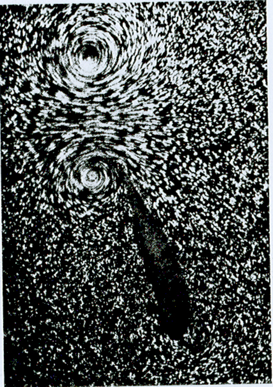
Figure 6.7.6. Vortices shed by an aerofoil which has been brought from rest to a steady motion suddenly and later stopped suddenly. (From Prandtl and Tietjens 1934.)