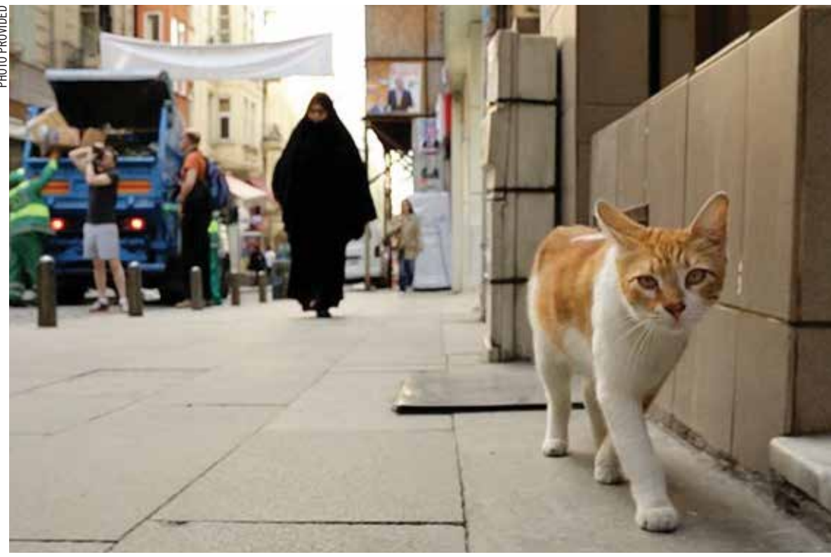
Kedi (2016), a documentary film about the cats of Istanbul, is for cat lovers of all ages.

Southold Dance Theater 7 p.m. Friday, May 26 2 and 7 p.m. Saturday, May 27 2 p.m. Sunday May 28 Ticket prices: $28; $25 faculty/staff; $18 seniors/students Patricia George Decio Theatre Southold Dance Theater is proud to present its debut production of Don Quixote. The ballet is built on episodes from the novel "Man de la Mancha" by Miguel de Cervantes.