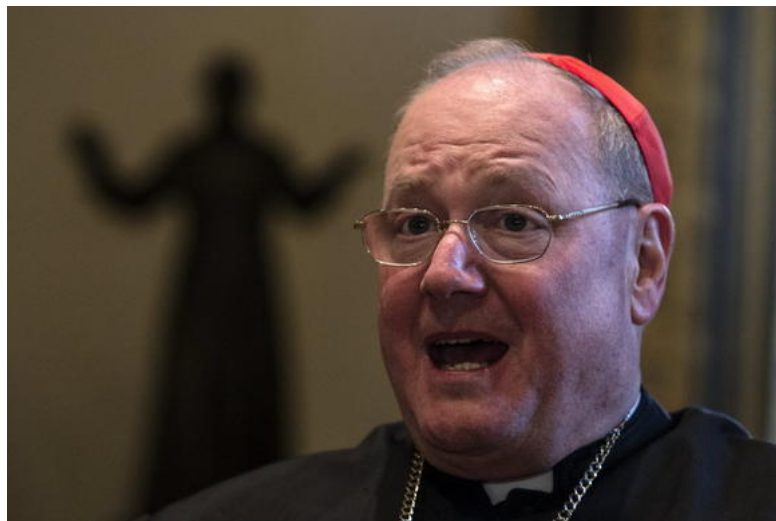
Cardinal Timothy Dolan (March 6, 2013)

South Bend Tribune Report 10:35 a.m. EST, March 6, 2013