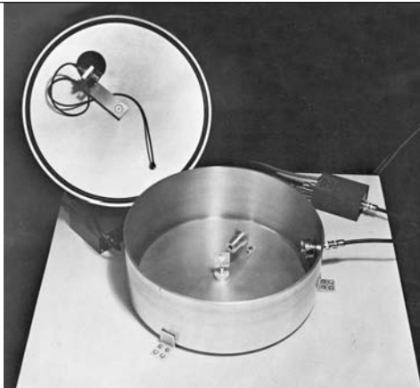
Fig. 15.3. An Example of a Rutherford Scattering Vacuum Chamber.*

*The Rutherford Scattering Chamber incorporates a mount for the ^{241}\text{Am} source with source collimator, a centered holder for a thin gold foil, and a silicon, solid-state detector mounted on an arm suspended from the lid. The arm permits detector rotation through the desired scattering angles. The silicon detector mounted in a fixed position is optional, and can be used for coincidence experiments. The collimator aperture limits the solid angle for alpha-particle emission so that the surviving alpha particles (with the foil removed) fall within the sensitive area of the detector when it is located at a 0^\circ scattering angle. The central foil holder permits rotation of the foil with respect to the incident direction of the alpha particles. The chamber requires a fore pump capable of achieving a vacuum below 200\ \mu\text{m} . A vent/pump valve is recommended to make pumping and release of the vacuum convenient without turning off the fore pump. A baffle may be needed in the chamber to prevent rupturing the thin metal foils during rapid pump-down and venting.