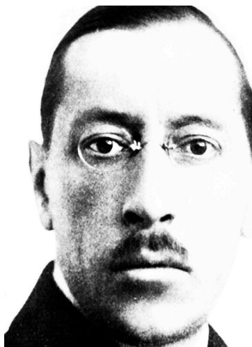
Stravinsky Mass for Chorus & Winds