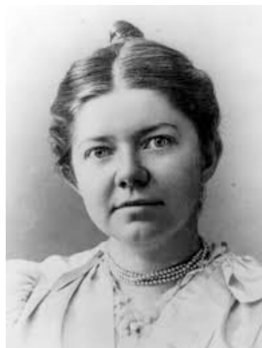
Beach Browning Songs