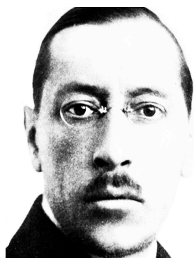
Stravinsky Mass for Chorus & Winds