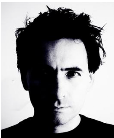
Girardet Lux Aeterna for Chorus & Piano