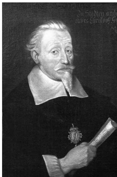
Schütz Cantiones sacrae

With stops in Scotland, Germany, Hungary, Jordan, England & Ireland