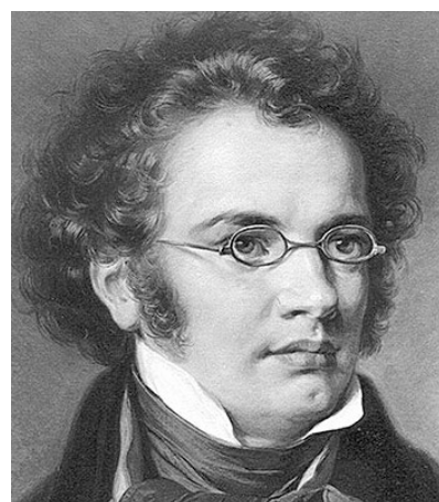
Schubert The Trout