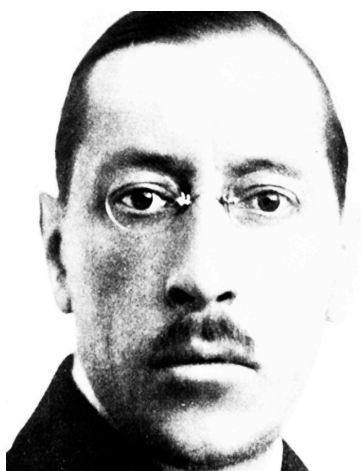
Stravinsky Mass for Chorus & Winds