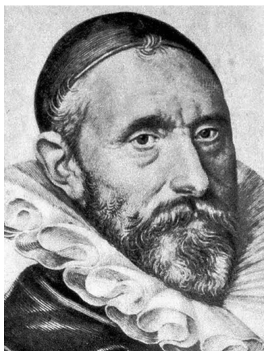
Sweelinck Hodie Christus natus est