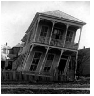
Images from the Galveston hurricane,1900, and the seawall under construction in 1905. <a href="http://en.wikipedia.org/wiki/1900">http://en.wikipedia.org/wiki/1900</a> Galveston Hurricane