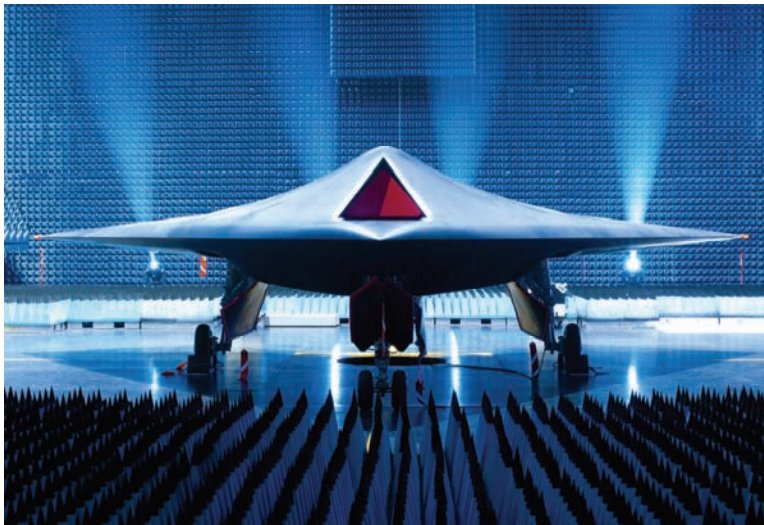
The United Kingdom's Taranis combat aircraft, whose prototype was unveiled in 2010, is designed to strike distant targets, “even in another continent.” While the Ministry of Defence has stated that humans will remain in the loop, the Taranis exemplifies the move toward increased autonomy.

responded, “This is a very sensitive area we are paying a lot of attention to.” 65 He thus left the door open to the possibility of greater autonomy in the future. 66