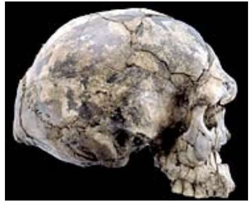
David L. Brill

Except for a few archaic characteristics, the skulls are readily recognizable. They are longer than their Neanderthal contemporaries from Eurasia or earlier ancestors. Their midfaces are broad, but the nasal bones are tall and narrow. The brow ridges are less prominent than those displayed in skulls from earlier branches of the family tree. And the cranial vaults are higher and within modern dimensions.