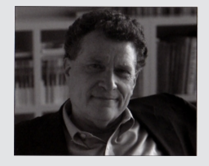
"I do not exist!"

Let's consider the first option first: the option of rejecting the initial premise of every sorites argument.