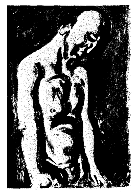
Plate XXXV Jésus sera en agonie jusqu'á la fin du monde ...