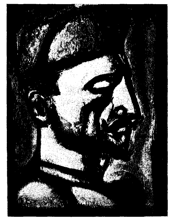
Plate LII Dura lex, sed lex