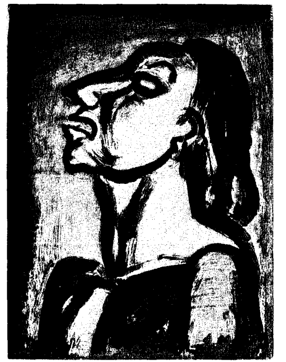
Plate XIX Son avocat en phrases creuses clame sa totale innocence...