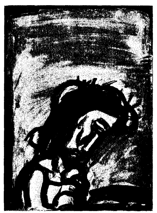
Plate II Jésus honni ...