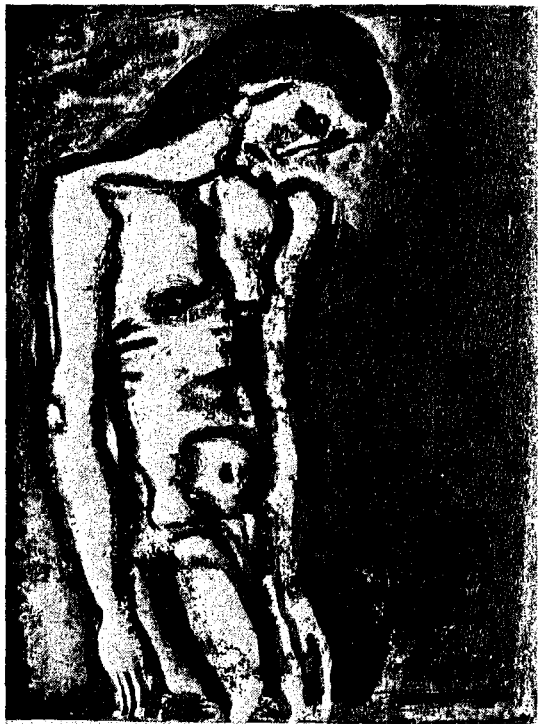
Plate III Toujours flagellé ...