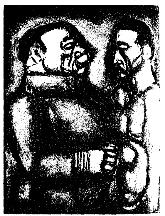
Plate XL Face a face