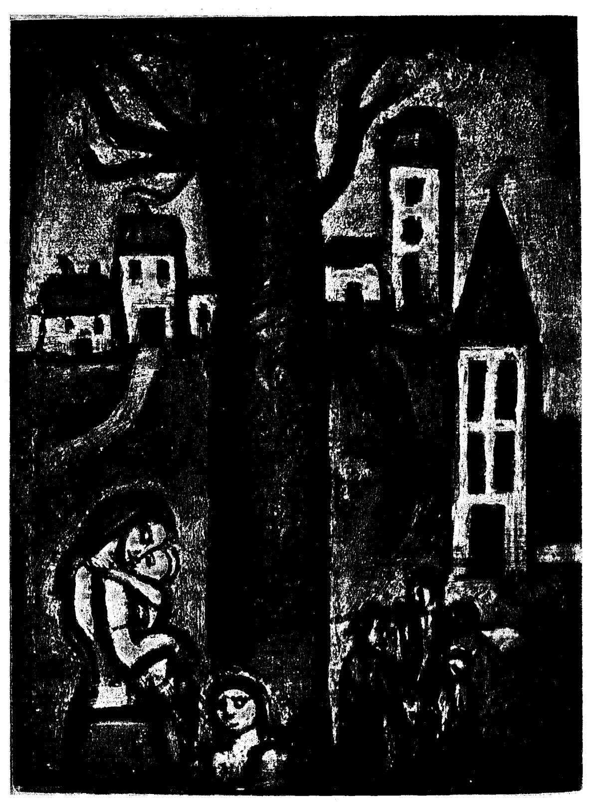
Plate X Au vieux faubourg des longues peines