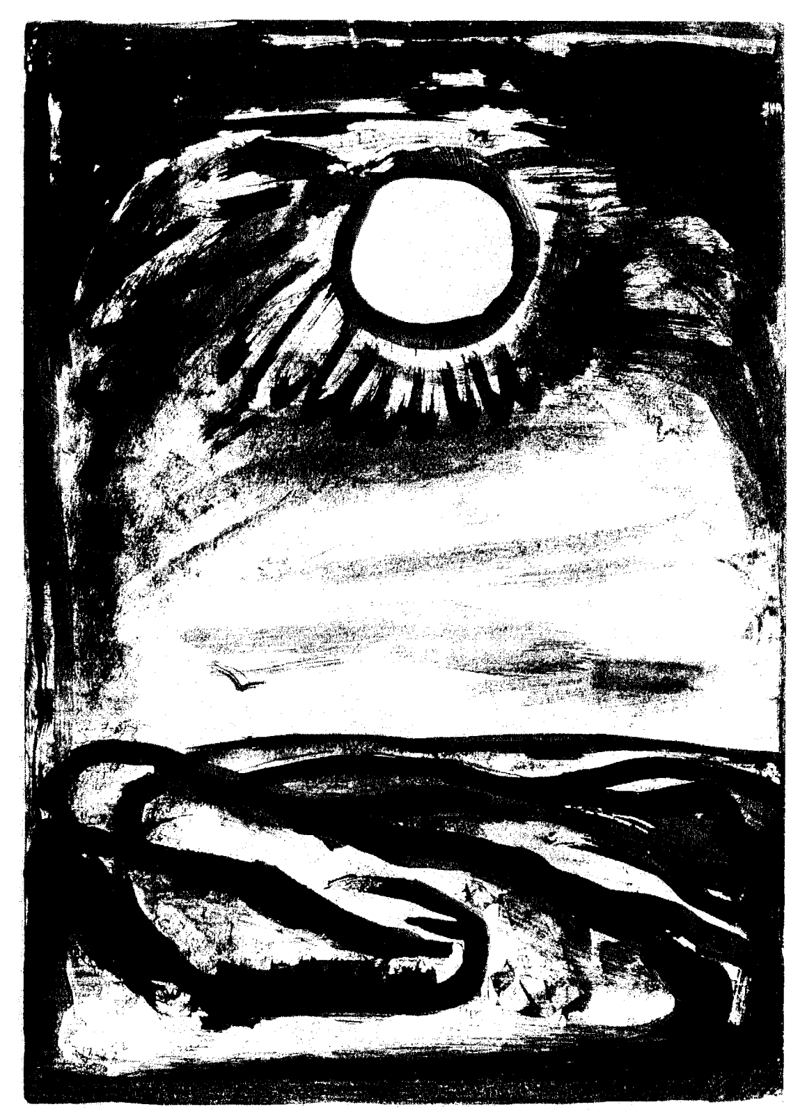
Plate XXIX Chantez matines, le jour renaît