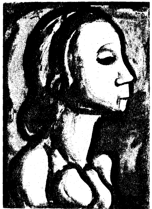
Plate XVI Dame du haut quartier croit prendre pour le ceil place réservée