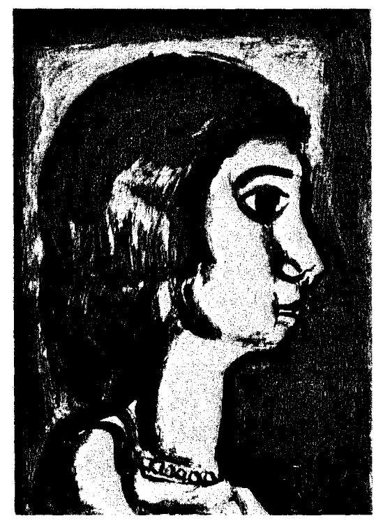
Plate XIV Fille dite de joie