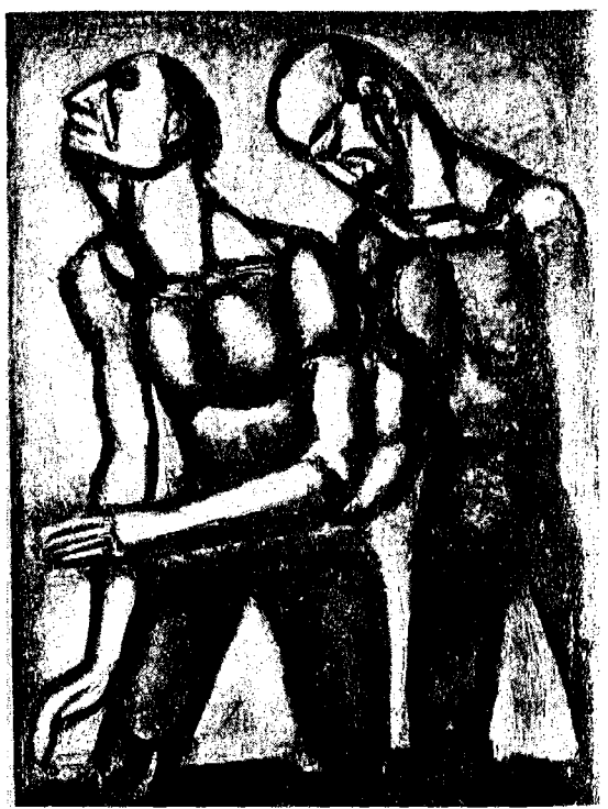
Plate LV L'aveugle parfois a consolé le voyant