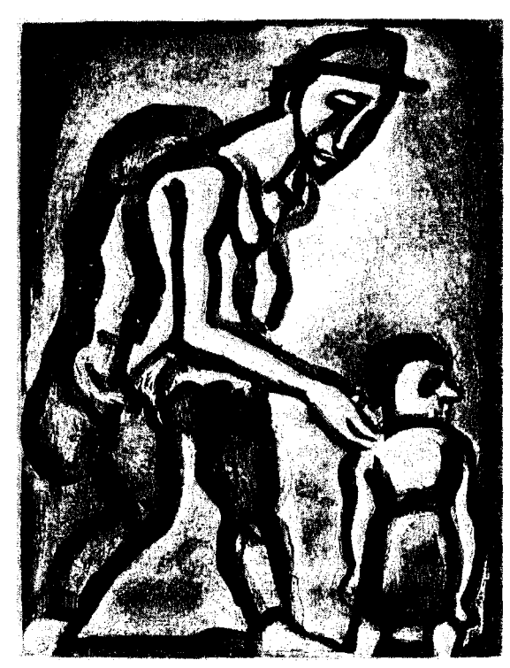
Plate IV Se réfuge en ton coeur va nu-pieds de malheur