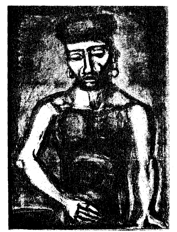
Plate XXV Jean-François jamais ne chante alleluia ...