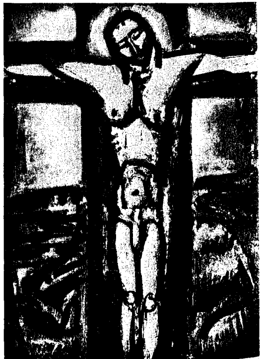
Plate XX Sous un Jésus en croix oublié lá