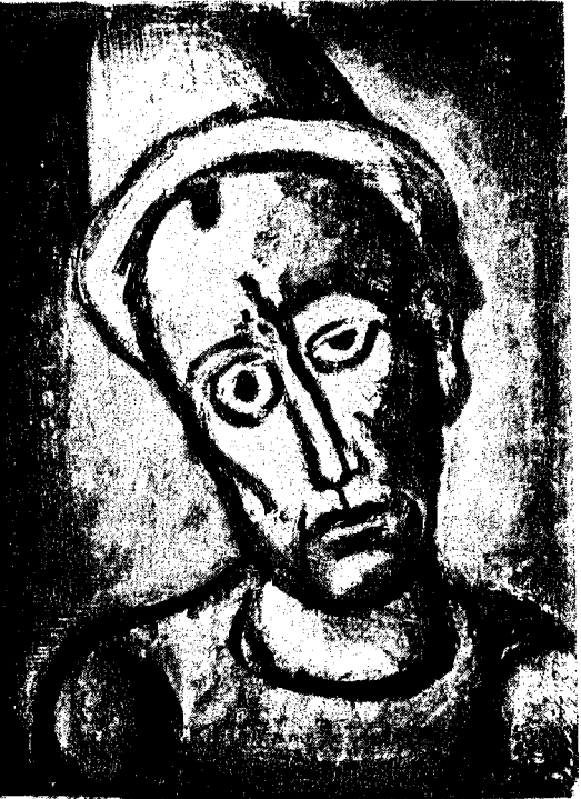
Plate VIII Qui ne se grime pas