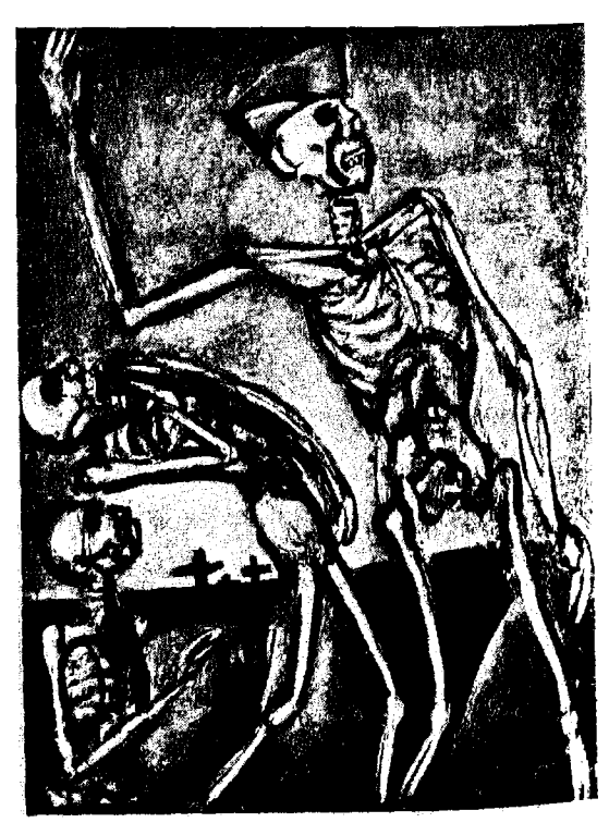
Plate LIV Debout les morts