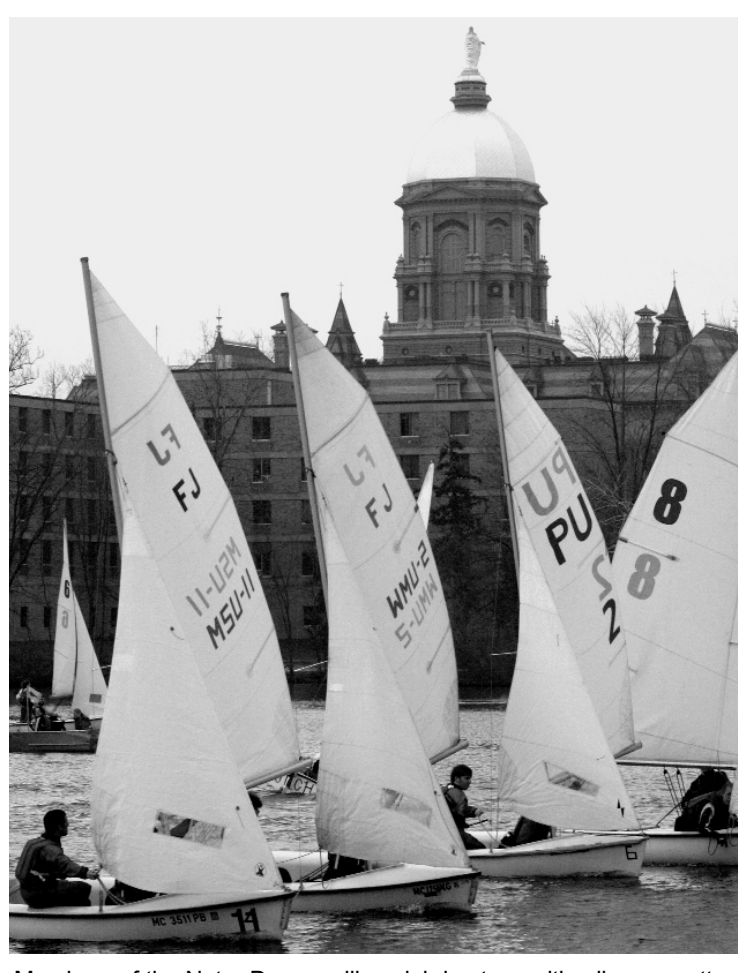
Members of the Notre Dame sailing club host a multi-college regatta earlier this spring before moving many of their boats to Diamond Lake.