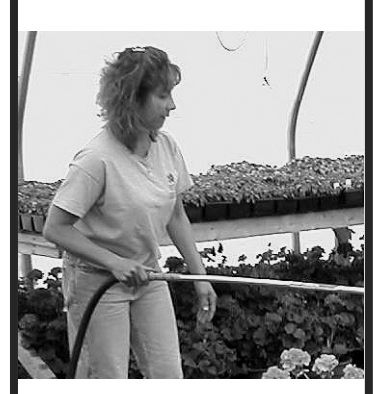
Spring and other transitions ...page 8