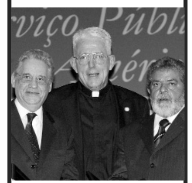
The Malloy presidency ...pages 4-5