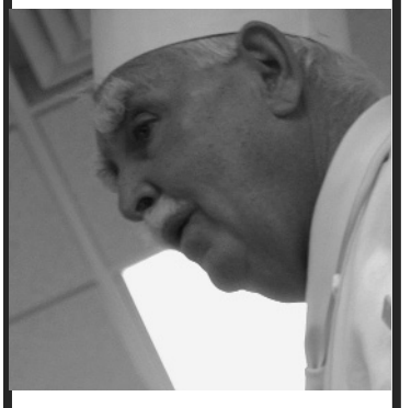
Back to the sea ...page 3