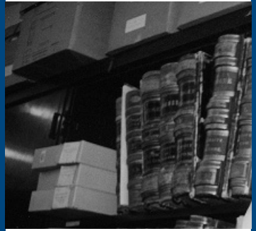
Knowledge in the 21st century ...pages 4-5