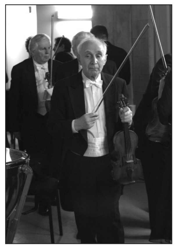
The musicians file in to the Leighton Concert Hall.