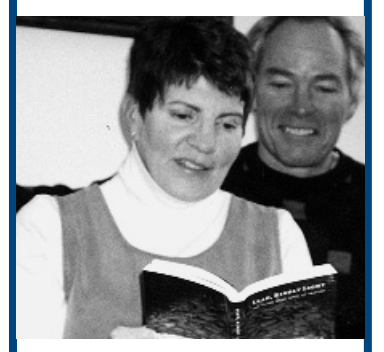
On marriage and Valentine's Day ...page 3