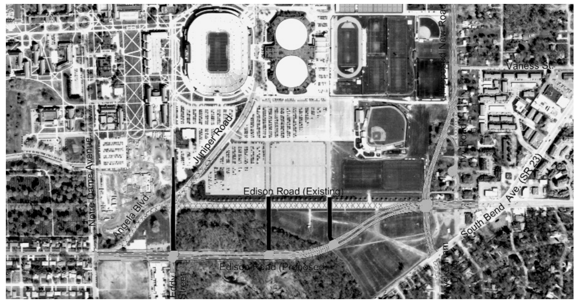
Notre Dame stadium and the Joyce Center anchor the top of this map, which shows how Edison Road is being rerouted through the Notre Dame woods to meet up around Ivy Road and Twyckenham Drive.