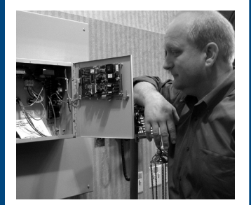
Ticktock...Change your clock