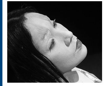
Of kimonos and Kabuki