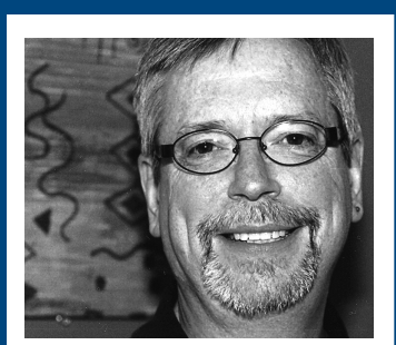
Making the Third World better ...page 2