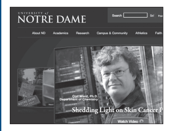
Presenting ND.edu... pages 4-5