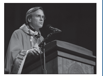
Opening the year with ceremony... page 8