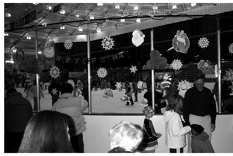
This photo of last year's family Christmas skating party shows the fun to be had from 5 to 7 p.m. Thursday, Dec. 20.

Holiday hours for all campus sports facilities including Rolfs Sports Recreation Center, the Rockne Memorial and Rolfs Aquatic Center will be available at recsport.nd.edu after Dec. 7.