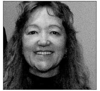
She's a legend ...page 6