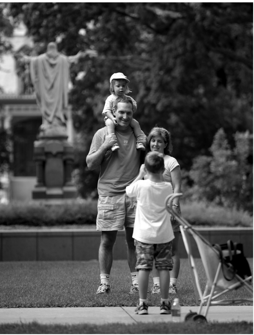
Alumni play an interesting role in the local economy. First, they comprise a solid number of the highly educated people living in St. Joseph County-more than 3,400 graduates in 2006. Those who don't live here come to visit, at events other than football games as this shot from Alumni Reunion Weekend illustrates. Visitor dollars totaled $114 million in 2006.

surveyed at the end of their internships, more than half of all participating students indicated that they were likely or very likely to take a job in the state after graduating," the report notes.