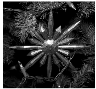
Oh Christmas Tree ...page 8