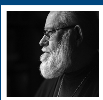
Putting St. Nick in perspective...page 2