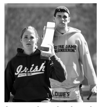
Impacting the local economy ...pages 4-5