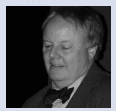
Astrophysicist Grant Mathews correlates the stories of the Bible and other ancient texts with astrophysical databases as he searches for evidence that the Star of Bethlehem really existed.

"These possible explanations are new in that they are based upon archives and imagery only recently available," he adds.