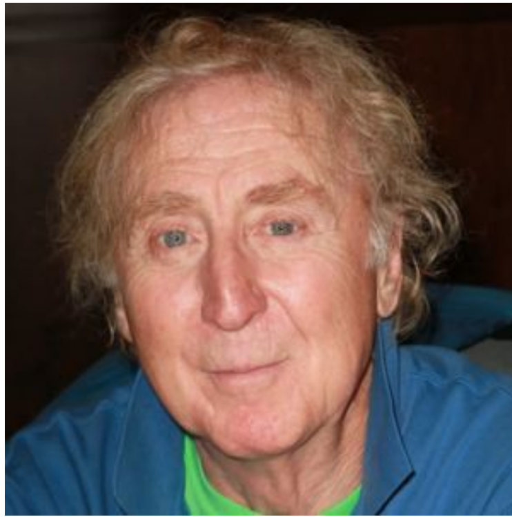
Dr. Frederick V. Fronkensteen

University of Transylvania Department of Electrical Biology