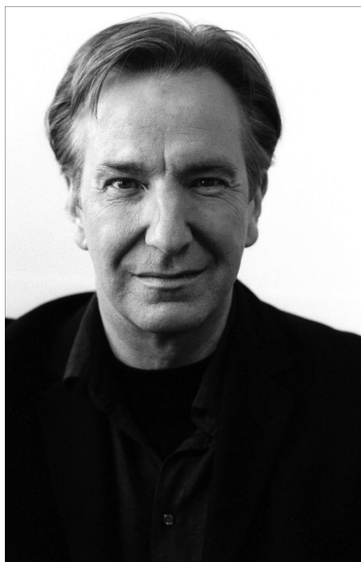
Dr. Severus Snape

Salazar Slytherin State University School of Pharmacy